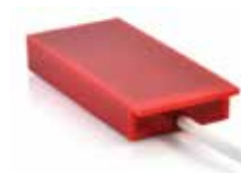
Rain Sensor for auto closing